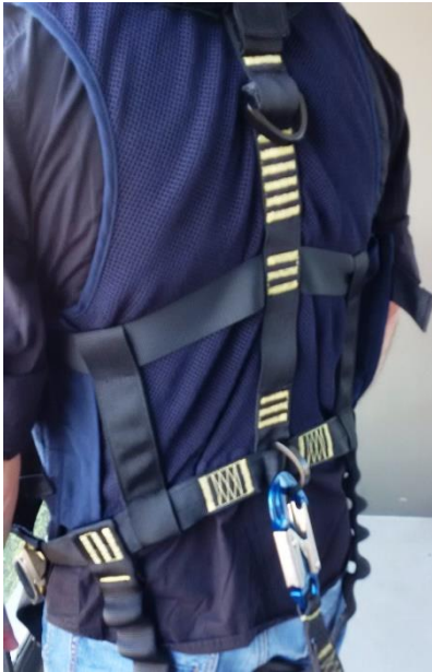
Dorsal Fall Arrest/Wincing D Ring & Waist Restraint D Ring