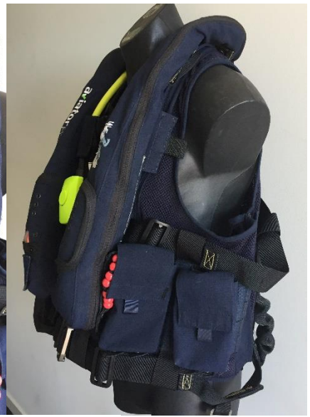
Spare Air Retainers – Left & Right-hand side options – MOLLE adjustable pockets

“The conditions tests and approvals stated in this document are minimum performance standards. It is the responsibility of those desiring to install the article either on or within a specific Standard or type or class of aircraft to determine that the Standard and or aircraft’s installation conditions are within the required standards. The article may be installed only if further evaluation by the applicant (user/installer) substantiates an acceptable installation and is approved by the Authority” and Poseidon’s .suggested Tests and Approvals are to be used as a guideline only – Poseidon makes no claims that any tests and approvals shown are suitable or fit for purpose.