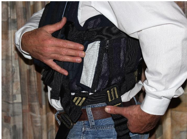
Expansion Gussets for Internal Armour