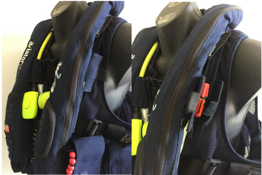
Quick Release Toggle (concealed) – rear Tether Release