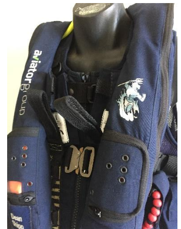
Concealable Lifting Strops

“The conditions tests and approvals stated in this document are minimum performance standards. It is the responsibility of those desiring to install the article either on or within a specific Standard or type or class of aircraft to determine that the Standard and or aircraft’s installation conditions are within the required standards. The article may be installed only if further evaluation by the applicant (user/installer) substantiates an acceptable installation and is approved by the Authority” and Poseidon’s .suggested Tests and Approvals are to be used as a guideline only – Poseidon makes no claims that any tests and approvals shown are suitable or fit for purpose.